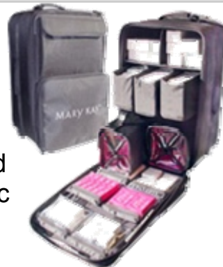
Wheeled Cosmetic Case