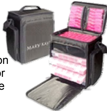
Slip on Color Case