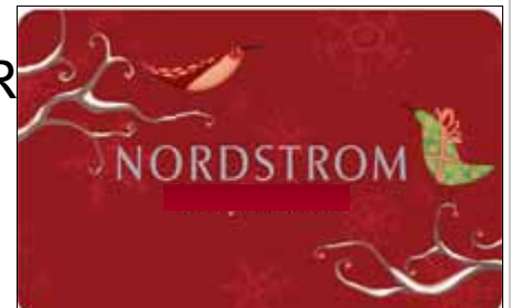
$100 Nordstrom Gift Card