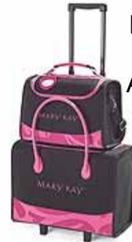
Roll-away Tote and Accessory case