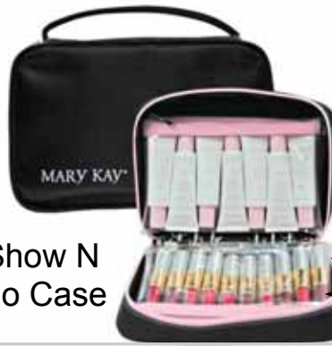
Show N Go Case